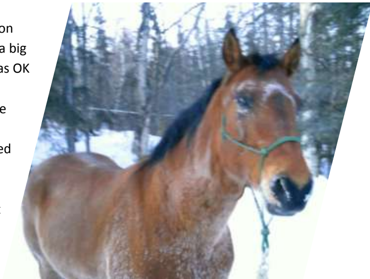
I don't look like a Moose!

Monet and I went on about our ride. We crossed a big swampy area that wasn't too deep in snow; in fact it was OK riding for there was enough snow cover over the ice. However, when we got to the other side, the drifts were very deep and I decided we had to go back, so we did. Monet was some cows quite a distance away but wanted to watch and make sure they were not going to come after us and of course they paid no attention to us. After that, we walked and slipped all the way home but didn't see any other scary objects. I took some pictures of Monet when I got home at the gate, then put her away, feed hay and called it a day.